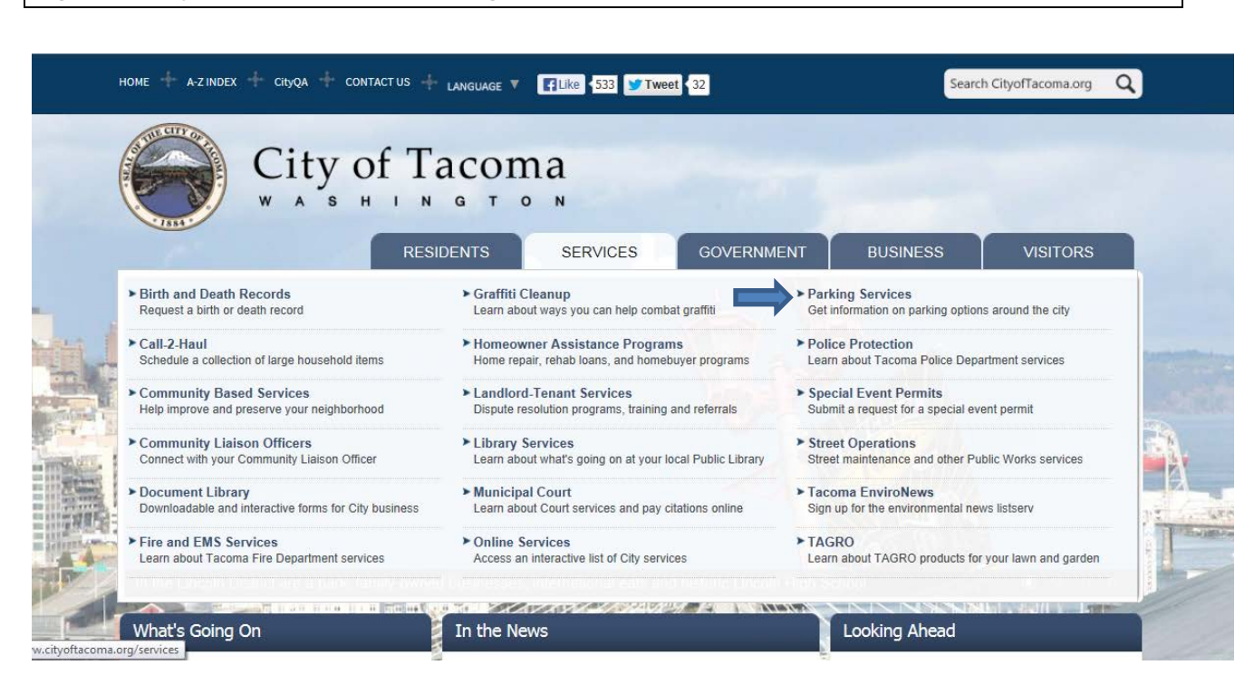
Figure 4: City of Tacoma Link to Parking on their Main Site

There are some great examples of cities all around the country that promote and explain their parking system, typically online. One great example is what the City of Tacoma has undertaken to keep citizens informed about downtown parking. There is a direct link on their website that takes patrons/citizens to information about parking. We encourage the City of Decatur, through the Downtown Parking Commission, to set up the same kind of link. This link will provide info on where to park, the cost of parking violations, special event parking, and so on.