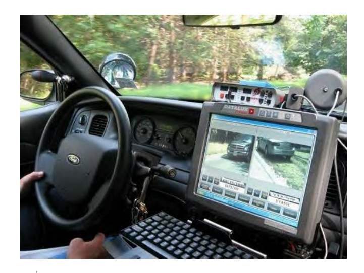
Figure 2: LPR Communications (mounted on vehicle, or handheld remote)