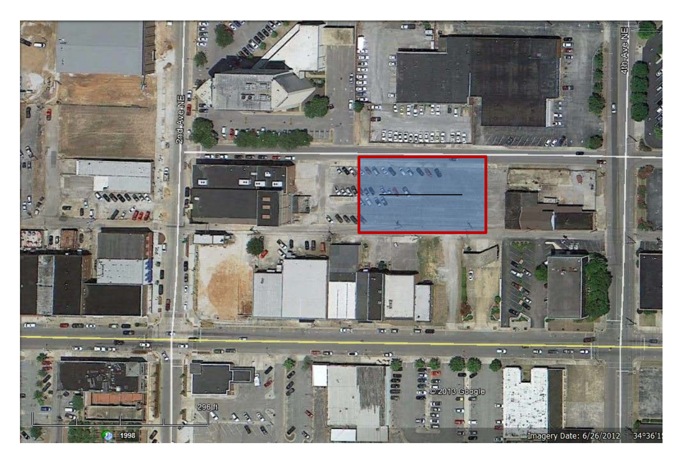
Figure 1: Potential Site for an Off-Street Garage

If a garage is considered for the Lot 11, it may require the closing of Holly Street to create an efficient, affordable garage. However, access could be through the garage, with curb cuts for accessing businesses along Holly Street. The dimension of a parking structure for this site would be 120' x 240'. The ramp for upbound/downbound circulation would be located on the elevation facing the alley. A three-story garage, consisting of four parking levels, would provide approximately 350 spaces on this site and provide proximate parking for the core of downtown. Ultimately, the City needs to work with the various land owners to develop parking improvements along Holly Street, improvements that will incorporate Lot 11.